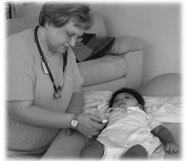
Babies who go home with their parents continue to receive services through Carousel, including regular visits from pediatric nurses.

Call Kansas City Hospice & Palliative Care at 816-363-2600 and ask for Carousel. Carousel can provide more information about services, or schedule a free assessment.